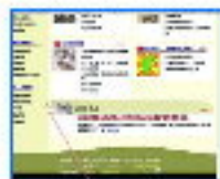
Touch or Laser Control as you will

User can write, paint, remark and amend text or picture at wall and save to computer. These texts and pictures can be printed, send by e-mail or attach to other softwares.