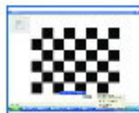
Light and pen, operate with 2 words

You can write, print, remark on the projected screen and operate all the functions and program of computer (the maximum projected distance is 7M)